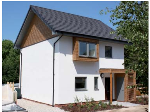
Figure 1: The Renewable House on the Innovation Park at BRE near Watford, Herts, constructed with hemp lime walls

Industrial hemp is now grown again in Europe and North America, having been banned for a period due to the connection with cannabis (industrial hemp has very little active drug). It can be grown in many temperate climates, and in the northern hemisphere is usually planted in April and harvested at the end of August. Hemp is a fast-growing plant, reaching a height of 3–4 m at harvest with no need for pesticides or herbicides after planting. Once harvested, cut hemp is sometimes allowed to dry initially in the field before the shiv (the woody central core) is separated from the outer fibres. The fibres are extracted for a variety of uses (eg textiles, composites). After fibre extraction, the shiv is shredded into chips, graded and stored until required for construction.