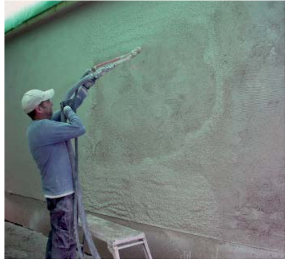
Figure 7: Applying a vapour-permeable render by spraying