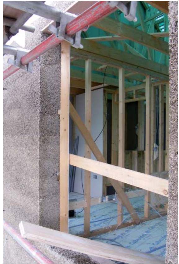
Figure 8: Completed wall ready for window frames and sills to be fitted