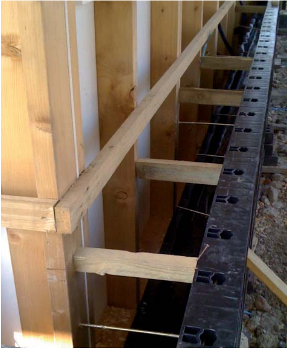
Figure 5: Shuttering in place ready to receive hemp lime