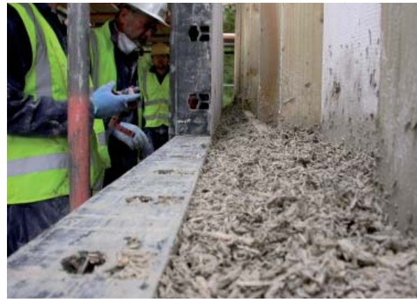
Figure 2: Freshly placed hemp lime

Like hemp, lime has been used for centuries for a wide range of applications: for construction, primarily in mortars and renders, together with being the antiseptic and antibacterial agent used in traditional whitewashing of houses. The hemp shiv forms the lightweight bio-aggregate, with the formulated lime as binding agent and the water initially providing workability and hydration of the binder. The components are combined in pre-bagged proportions (for walls typically 1 part hemp to 1.5–2 parts lime) to create a mixture similar to ‘damp muesli’ in appearance (Figure 2). It is important to control carefully the quantity of water and methodology of mixing to deliver acceptable placement performance and drying times. The material can be overcompressed with immoderate tamping, but it is important to ensure that formwork is uniformly fitted. Spraying hemp lime requires specially adapted equipment and a high level of skill to deliver a consistent replacement process. The mix has to dry to reach optimal thermal resistance, but protected by lime binder and a render (or other vapour-permeable external finish) it provides long-term performance without deterioration.