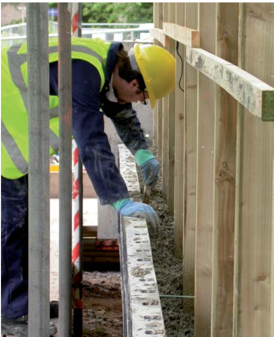
Figure 6: Tamping hemp lime into shutters